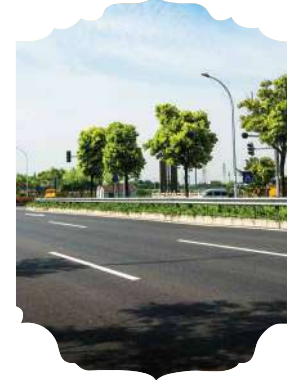
Well-planned internal roads