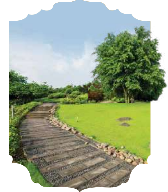
Lush green open spaces

A community designed to help you breathe a little deeper and live a little better.